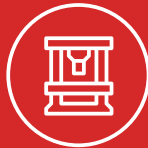
CNC 200-ton press brake