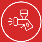
In-house powder-coating facility