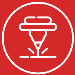
CNC laser cutting machine

Our capabilities include a dedicated in-house design and engineering team supported by advanced manufacturing infrastructure such as: