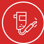
MIG/ CO 2 welding machines

This integrated setup enables us to maintain superior quality standards, optimize production timelines, and offer custom-built solutions for diverse industrial requirements.